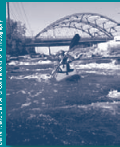
Denver Metro Chamber of Commerce

4–7 PM Social Norms Conference Registration